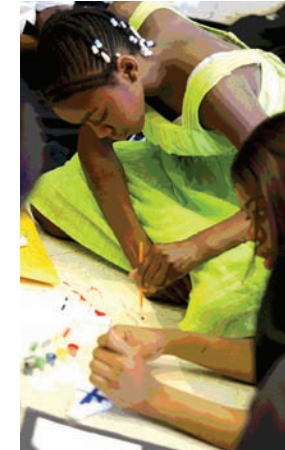
VISUAL ARTS AND MATHEMATICS