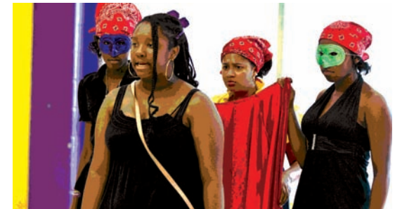
LANGUAGE ARTS AND THEATRE