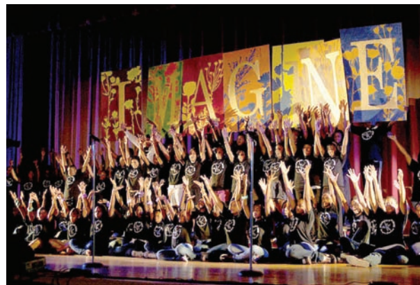
EXCITING MUSICAL THEATRE PRODUCTIONS