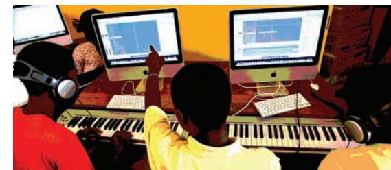
SCIENCE AND MUSIC